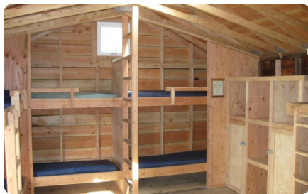
Typical Main Camp Cabin Interior

Main Camp cabins are off grid, rustic, and are located on the beach or nestled among the trees. Fully enclosed, these have bunk beds for 12 guests and cubbies to store your belongings. Participants provide their own linens. Bathroom facilities with showers are a short walk away. Most cabins do not have electricity. If you require electricity for medical reasons, please inquire about availability during registration.