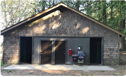
Main Camp Bathrooms & Showerhouses